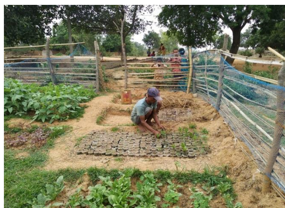
Bipan at his kitchen garden, taking care of the seedlings

System). All round the year he grows variety of crops which includes paddy, pulses, millets, vegetables, turmeric and different types of fruit crops. In animals he has got cow, bull, goat, sheep and pigeon. The total number of animals he has now is 200. He has his own vermicompost unit. He prepares bio-pesticides and liquid manures for spraying and applying in his crops.