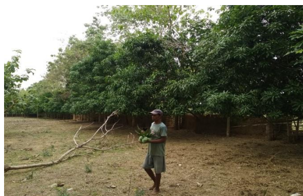
Bipan amidst his fruit crops garden with mangoes and jackfruits harvested for marketing